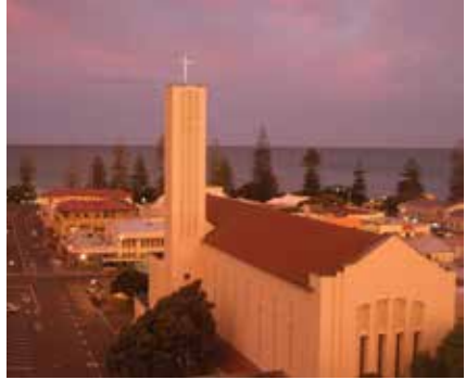
Front cover image: Waiapu Cathedral of St John the Evangelist, Napier