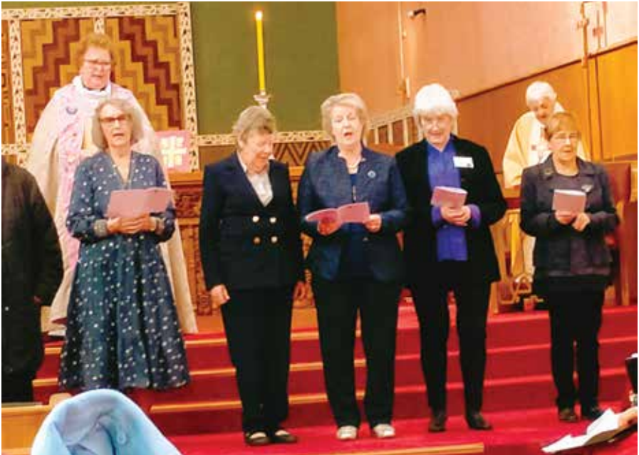
Commissioning service at Waiapu Cathedral